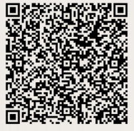
Centrona Zest A P51800003446

Site address: L&T Realty 77 CROSSROADS, Eastern Express Highway, Near Ghatkopar Jeejaabai Flyover, Ghatkopar East, Mumbai-400 077. Contact No.: 99025 99025 | E-mail: homes@larsentoubro.com Website: www.Lntrealty.com