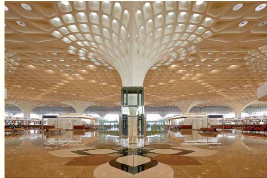
Chhatrapati Shivaji International Airport Terminal 2, Mumbai

Larsen & Toubro, a USD 21 Billion conglomerate. You've seen this name on megastructures, gigantic construction sites and in the headlines - reporting benchmark setting projects in India and abroad. From our earliest days of manufacture to our most recent projects, L&T has been a critical part of India's growth. Today, many of India's iconic buildings, airports to IT parks, malls to monuments, carry our signature of excellence.