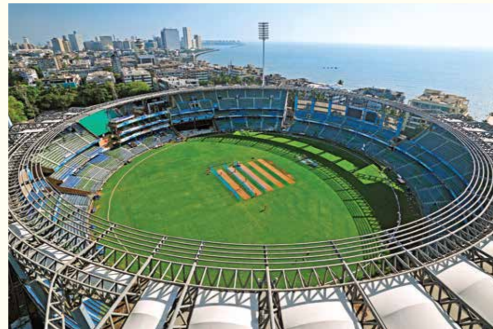
Wankhede Stadium, Mumbai

Larsen & Toubro, a USD 21 Billion conglomerate. You've seen this name on megastructures, gigantic construction sites and in the headlines - reporting benchmark setting projects in India and abroad. From our earliest days of manufacture to our most recent projects, L&T has been a critical part of India's growth. Today, many of India's iconic buildings, airports to IT parks, malls to monuments, carry our signature of excellence.